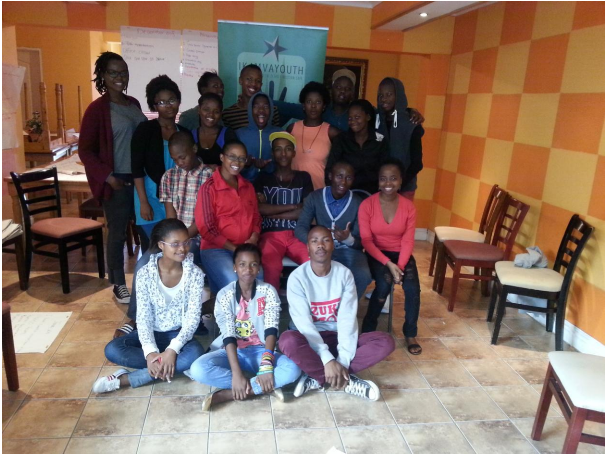
NYANGA BRANCH COMMITTEE 2014