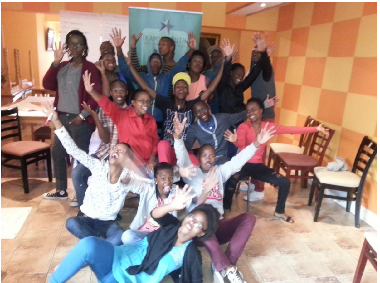
A GREAT END TO A PRODUCTIVE STRATEGIC PLANNING SESSION

The 2014 SPW was a very successful one and the action items set out for the year will need all nyanganites to participate fully in order for these to become a reality. A special thank you to all the learners and volunteers who attended and the IY staff from Makhaza and Masiphumelele who were present and facilitated the weekend long workshop. A special thank you also goes to Liziwe's guest house for providing a safe and beautiful venue for the SPW.