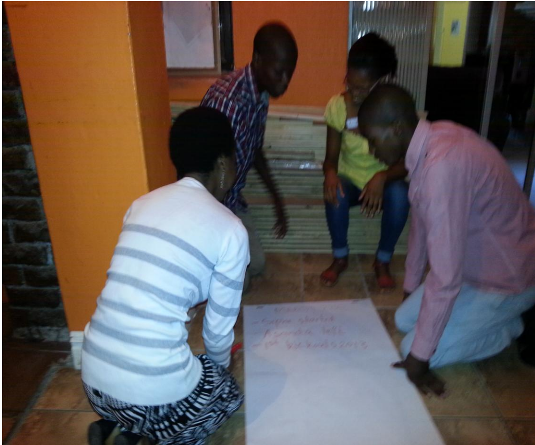
THE TEAM GOING DOWN MEMORY LANE, REMEMBERING WHAT HAPPENED IN 2013