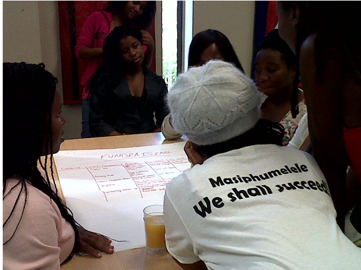
Brainstorming session about Fundraising and Community Engagement