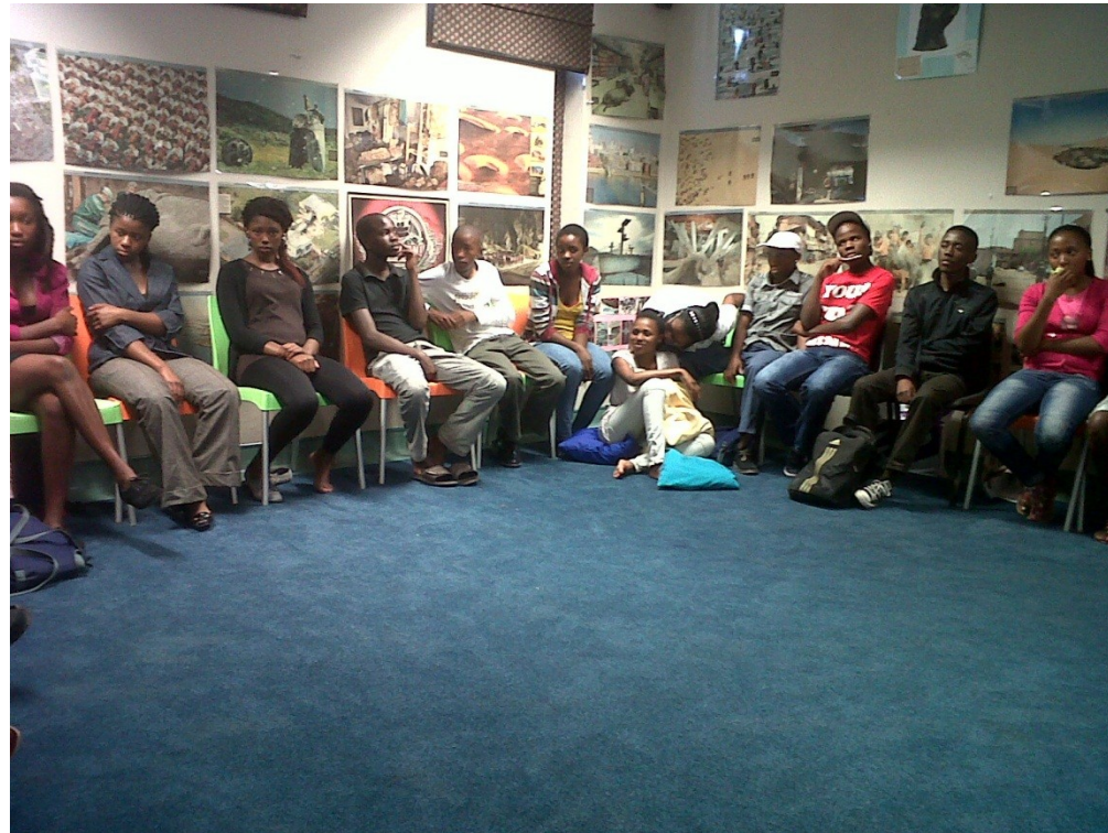
An overwhelming turnout at Masi SPW first session on Saturday 18 th February

“Because it is the right thing to do” (Anonymous)