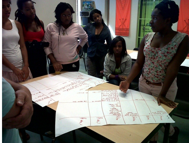
Presenting the Action Plan to the group